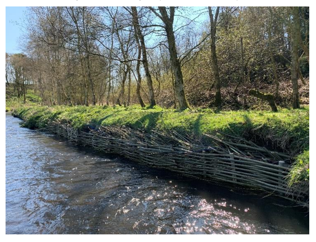
Fig 3, below showing completed Willow bank repair.