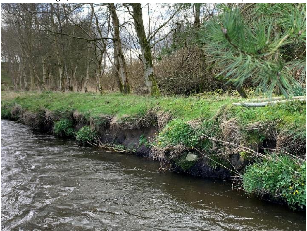
Fig 1, Before works commenced on the eroded bank repair.